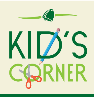
Have fun while learning all about Comté as a family!